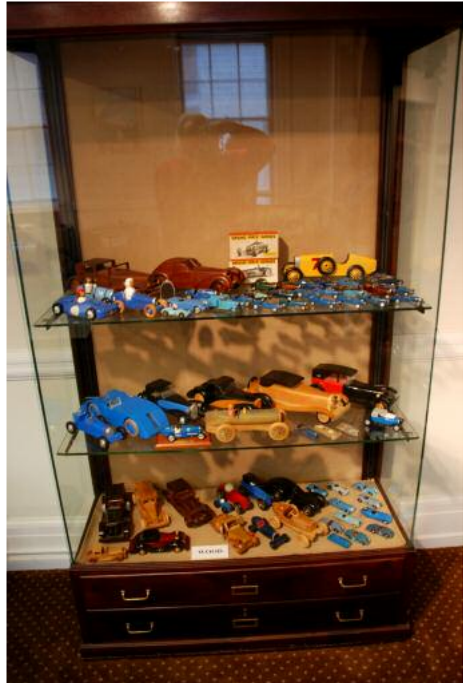
Wood: An early 3-D modeling material