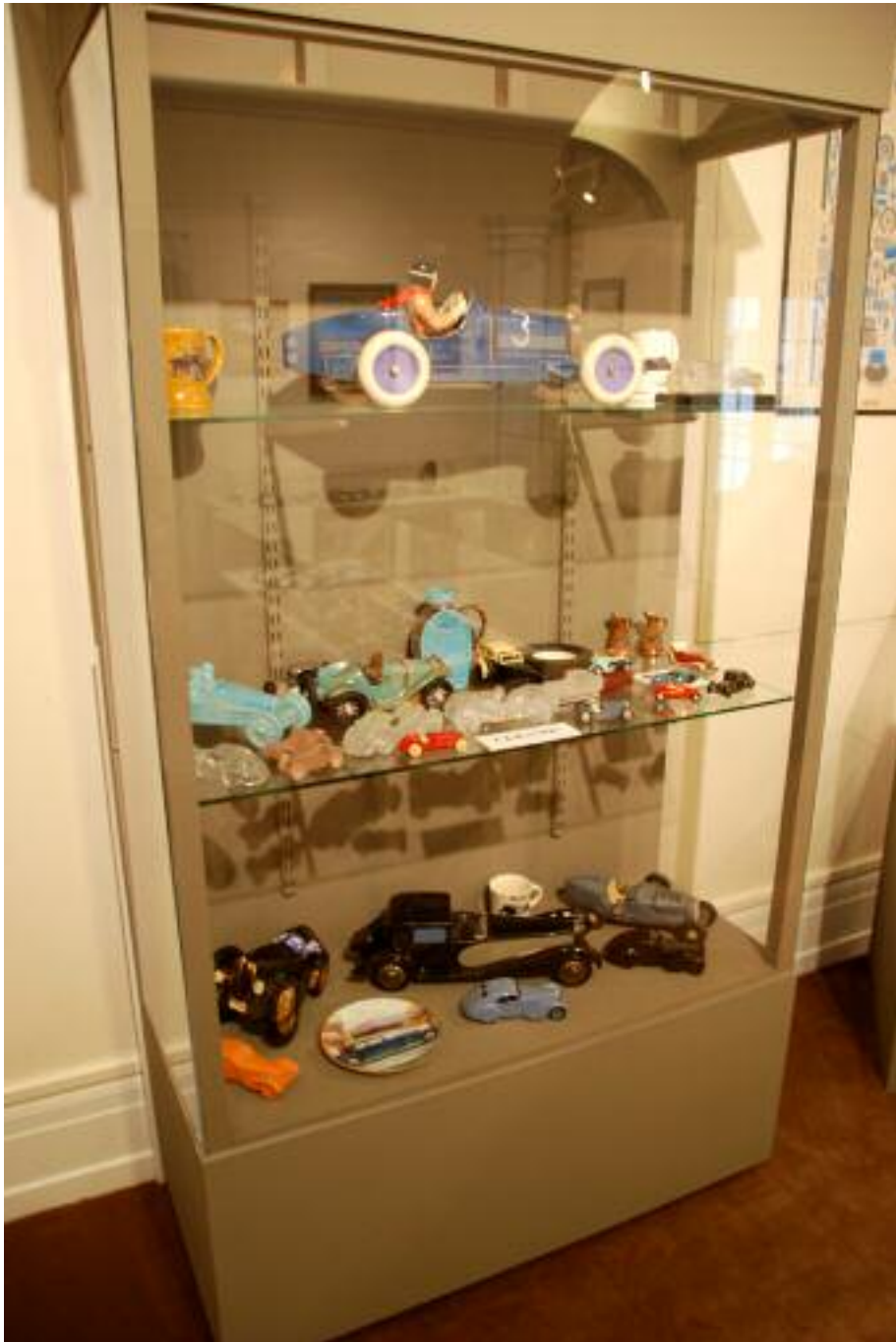
Ceramic: Something to Glaze Upon