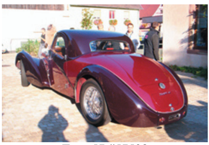
Type 57 #57598