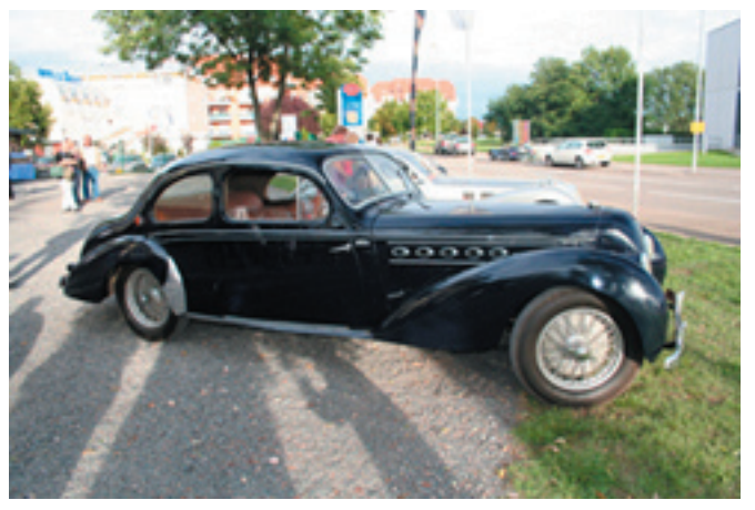
Type 101 #101502