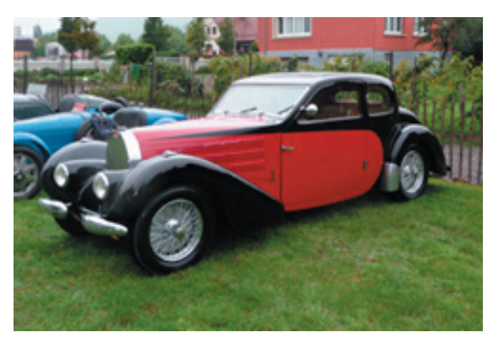
Type 57 Ventoux #57628