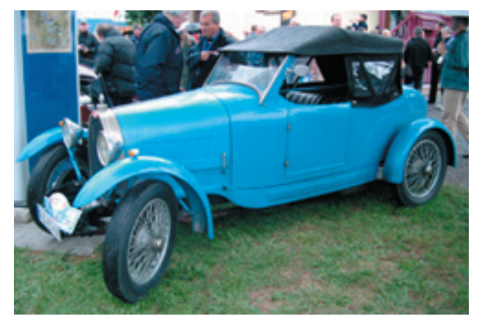
Type 40 #40671