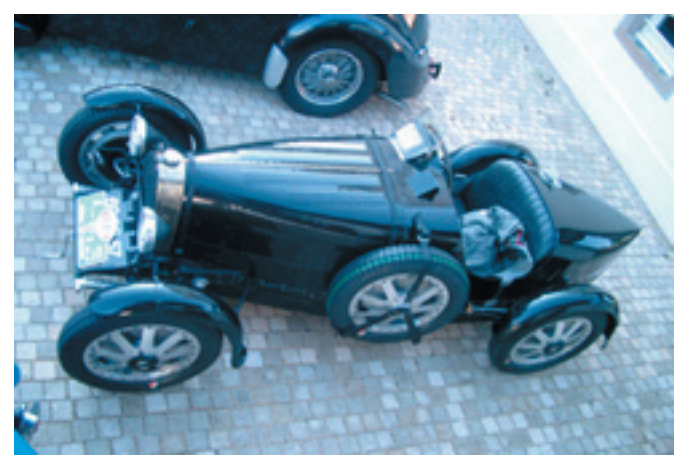
Type 35A #4780