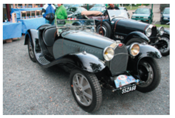
Type 55R #55227