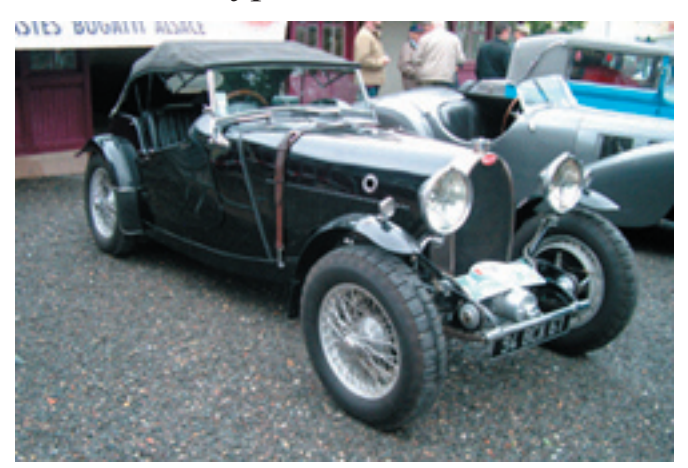
Type 40 #40642