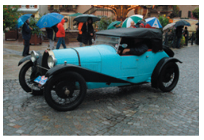
Type 30 #4637