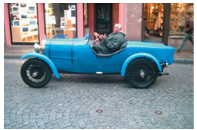
Type 40 #40657