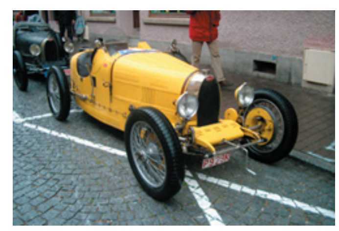
Type 35 #4799