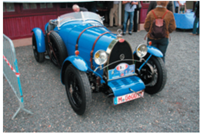
Type 30 #4108