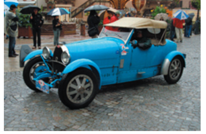
Type 43 #43196