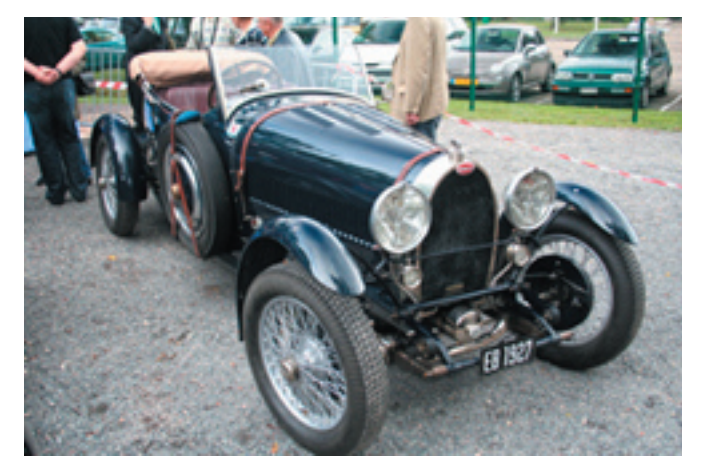
Type 38 #38333