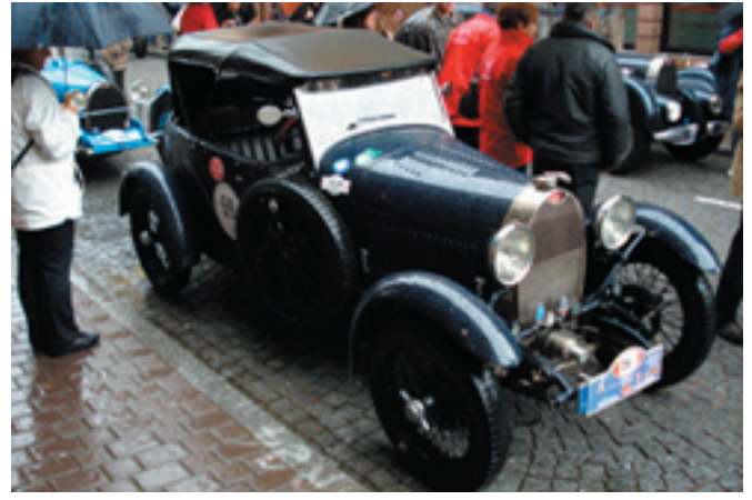
Type 40 #40221