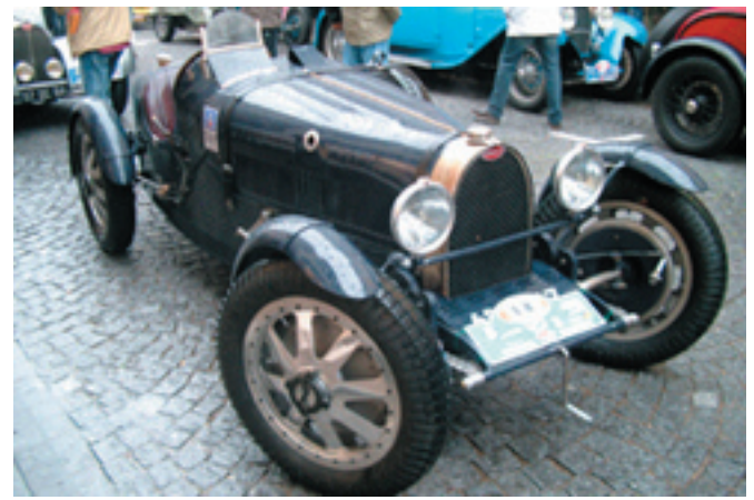
Type 35 (Pur Sang?)