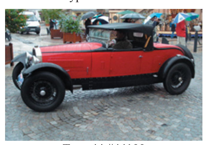
Type 44 #44100