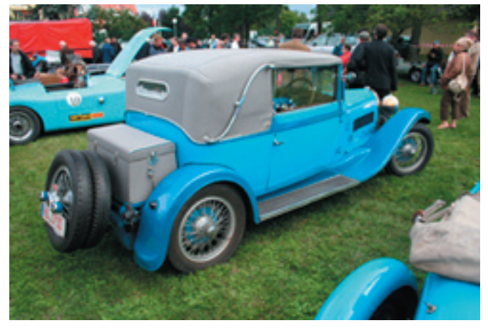
Type 44 #44931