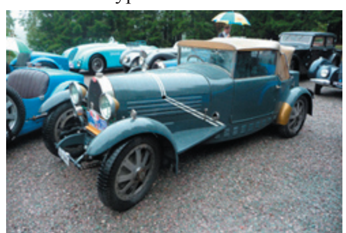
Type 43R #43275