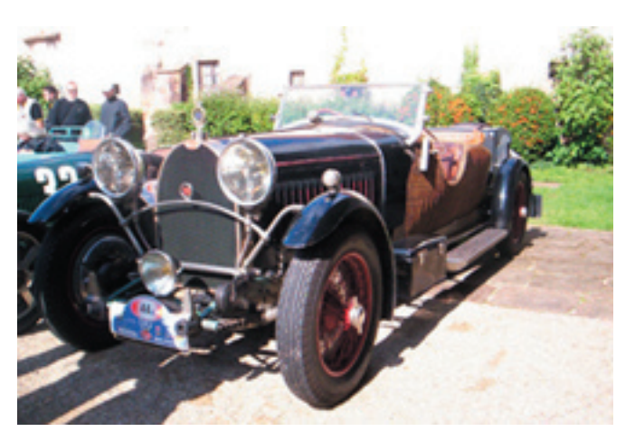
Type 46 S #46340