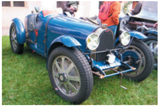
Type 51 (Pur Sang?)