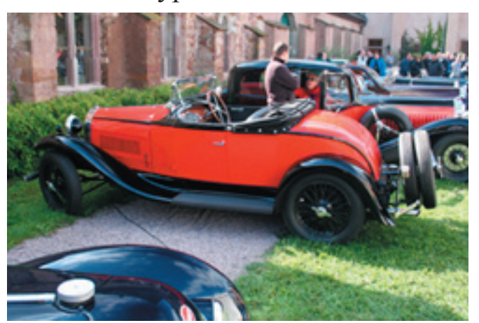
Type 40A #40930