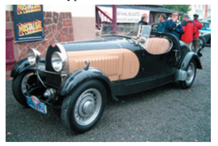
Type 49 #49274