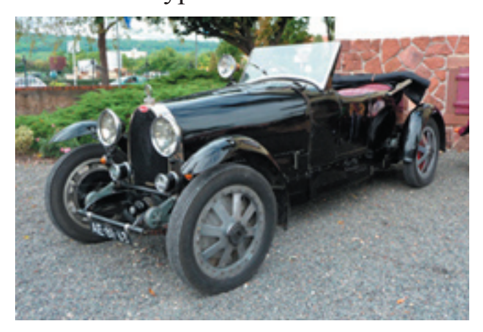
Type 43 #43183