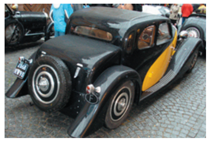
Type 57 Ventoux #57286