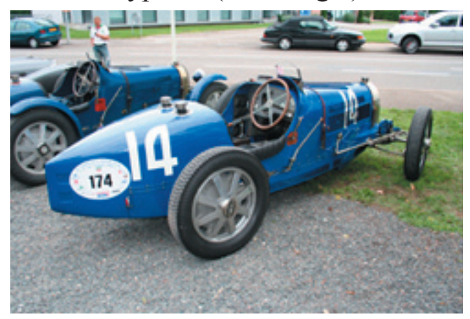
Type 51 (Pur Sang?)