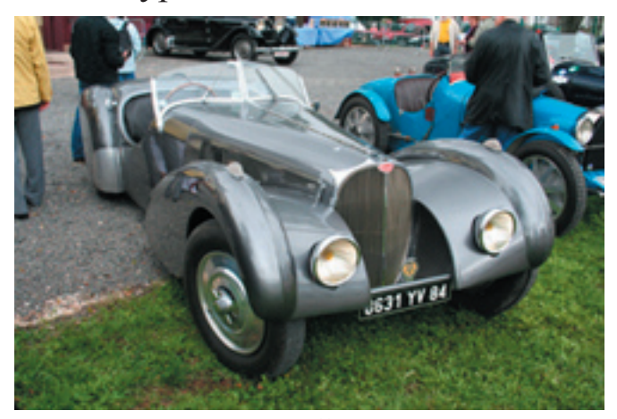
Type 57 SC #57 BC 116