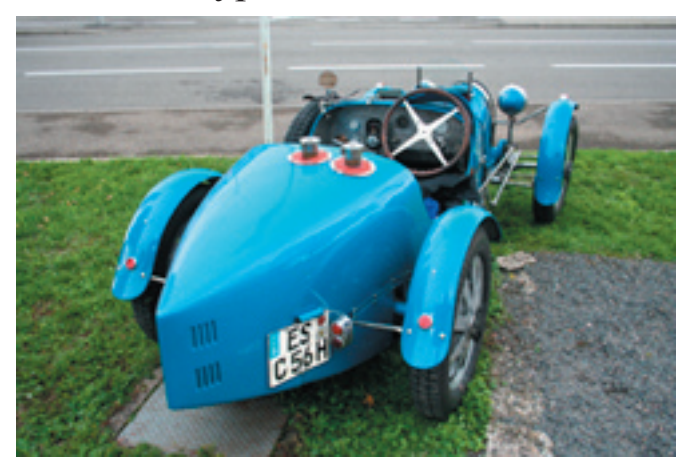
Type 51 (Pur Sang?)