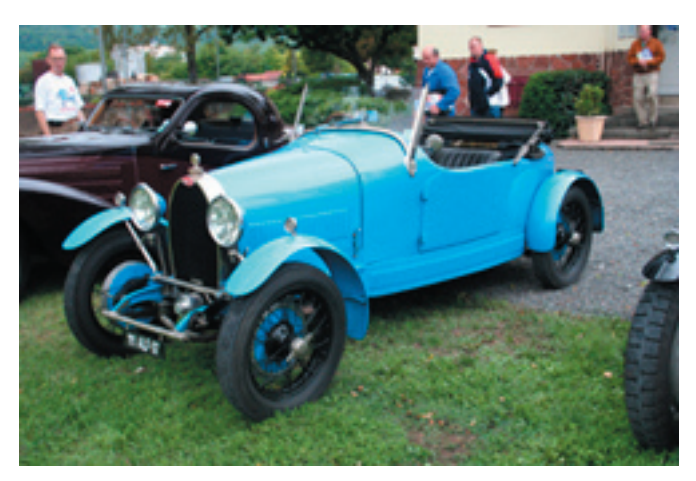
Type 40 #40842