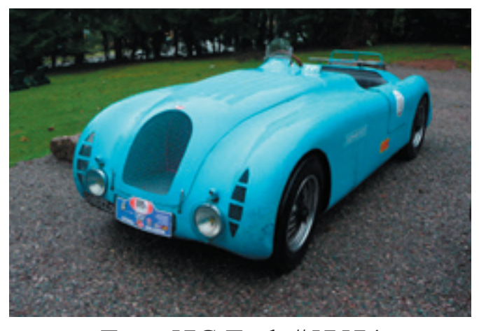
Type 57G Tank #57574