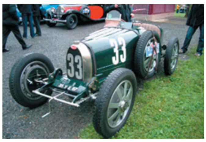
Type 35 (Pur Sang?)