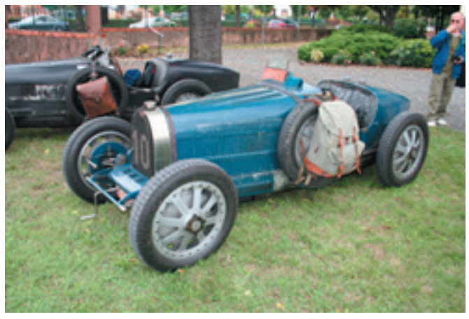
Type 35 #4928