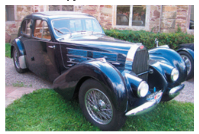
Type 57 Galibier #57761