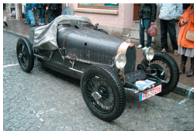
Type 37 #37224