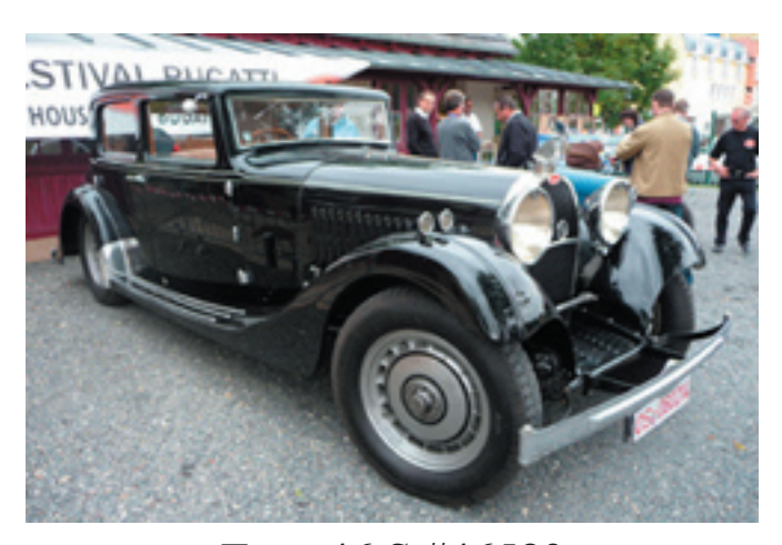
Type 46 S #46583