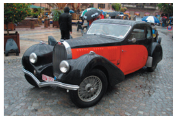
Type 57 #57524