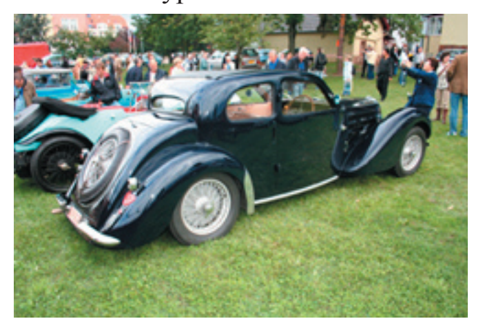
Type 57 #57662