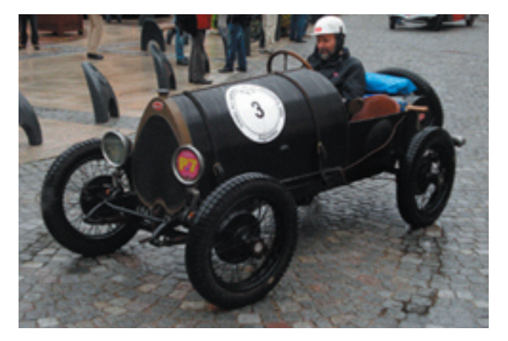
Type 13 #BC 072