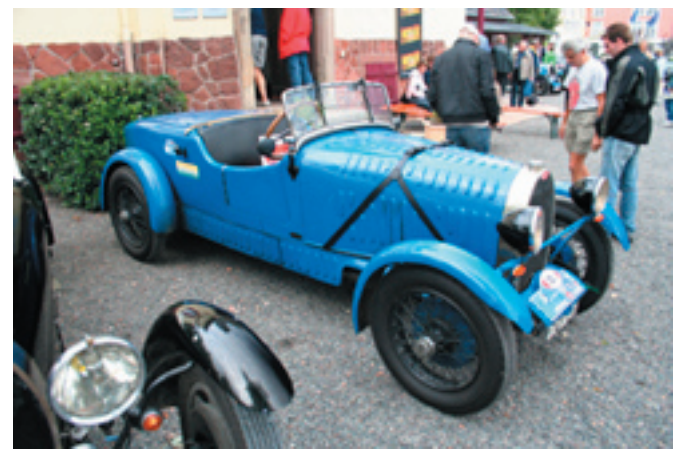
Type 40 #40636