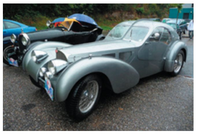
Type 57 SC Atlantic #57659