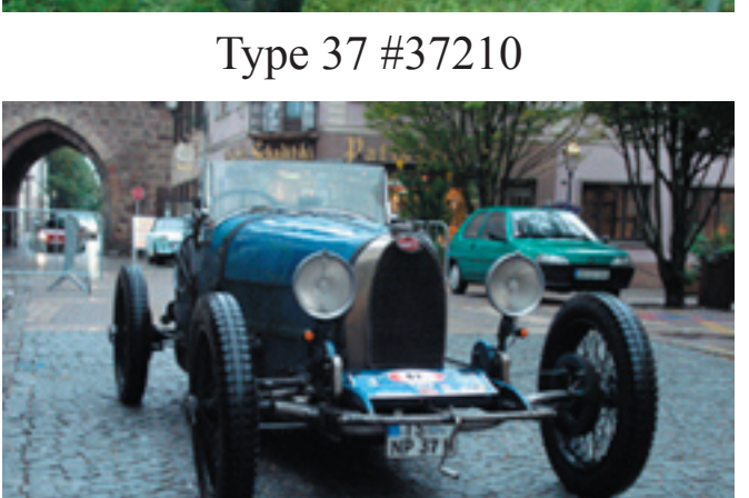
Type 37 #37234