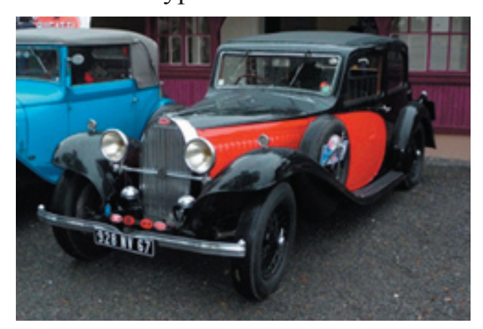
Type 57 Galibier #57225