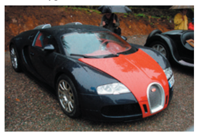
Veyron nr 55